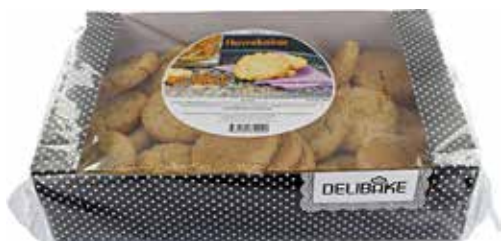
600 g tray