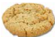
Farmers' Cookie Oatmeal Cookie