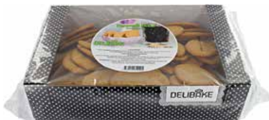
600 g tray