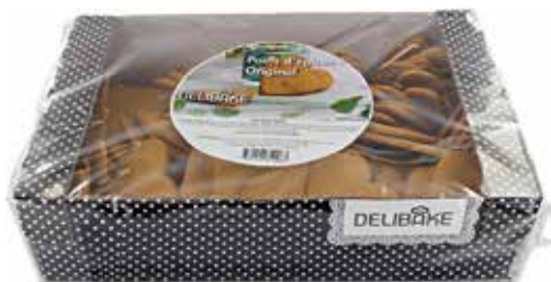
600 g tray