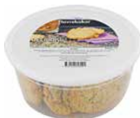
275 g tin