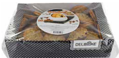
600 g tray