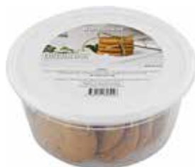
275 g tin