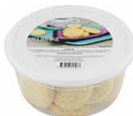
275 g tin