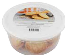
275 g tin