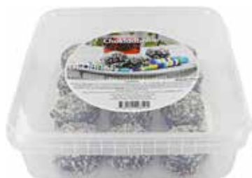
10-pack 500 g