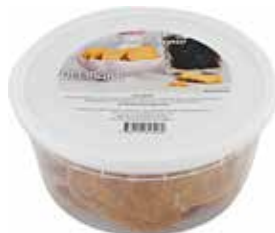
275 g tin