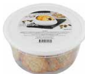
275 g tin