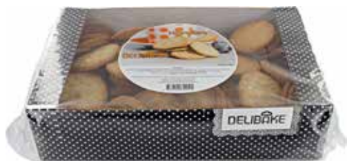
600 g tray