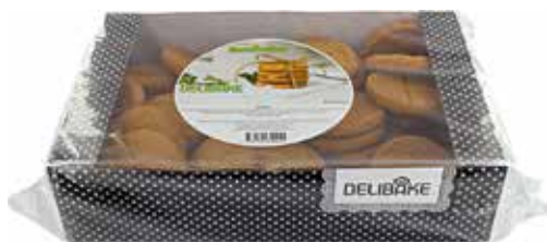
600 g tray