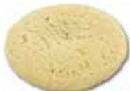
Caramel Cookie Vanilla Dream