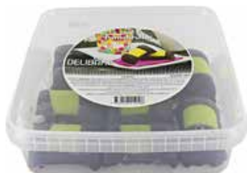
10-pack 500 g