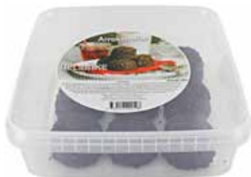
10-pack 500 g