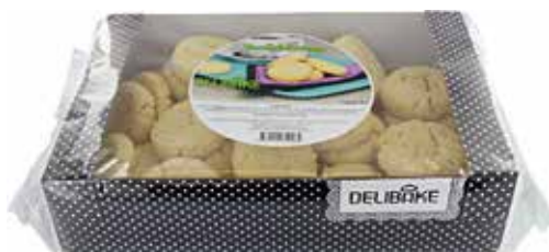
600 g tray