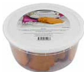
275 g tin