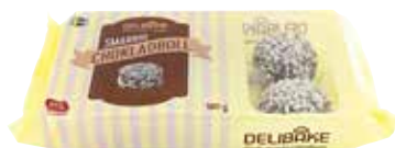
6-pack 180 g