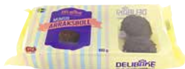
6-pack 180 g